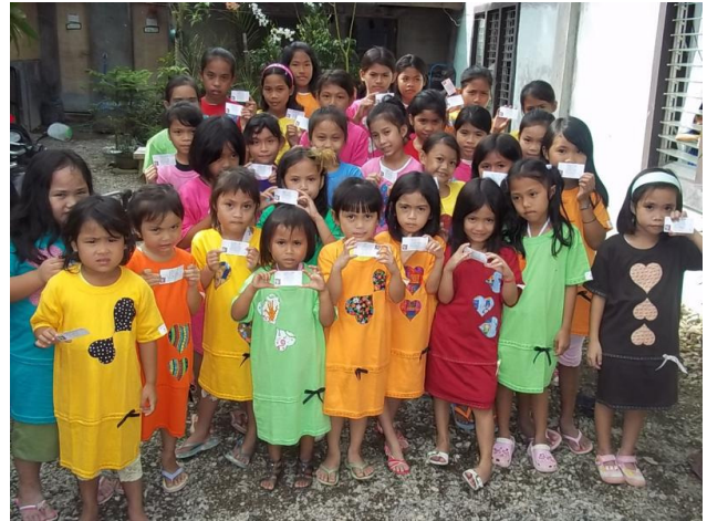
Dresses for Orphans had the honor of making new dresses for 450 of these girls!

Unfortunately, child trafficking is the new slavery! As many as 100,000 girls and boys are trafficked within the Philippines each year!